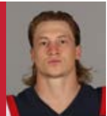
GUNNER OLSZEWSKI 1ST ALL-PRO SELECTION