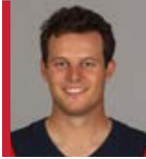
JAKE BAILEY 1ST PRO BOWL SELECTION 1ST ALL-PRO SELECTION