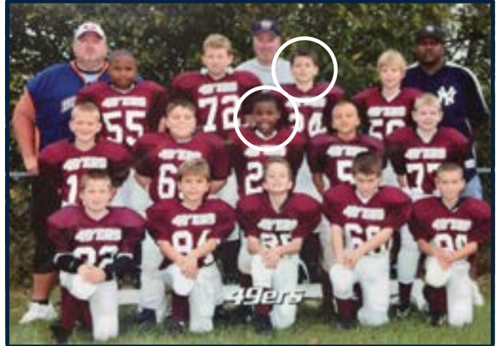
Patriots QB Jarrett Stidham and RB Damien Harris were youth football teammates for one season and went undefeated in the Madison County (KY) Youth Football League in 2003. Stidham moved to Texas but the duo stayed in touch over the years and even competed against one another in college before both were drafted by the Patriots in 2019.