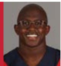
MATTHEW SLATER 9TH PRO BOWL SELECTION 4TH ALL-PRO SELECTION