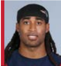
STEPHON GILMORE 4TH PRO BOWL SELECTION