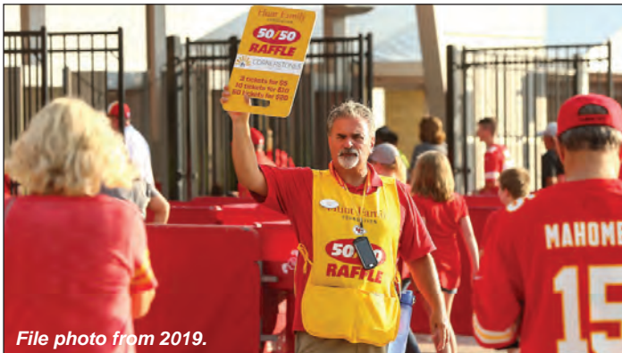
File photo from 2019.

The Kansas City Chiefs have announced the Hunt Family Foundation 50/50 Raffle will continue to take place at Arrowhead Stadium for all Chiefs home games in 2020, and has expanded its online presence to allow purchasers in the state of Kansas to purchase raffle tickets, in addition to fans in Missouri.