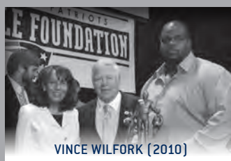
VINCE WILFORK (2010)