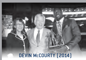
DEVIN MCCOURTY (2014)