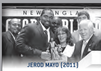
JEROD MAYO (2011)