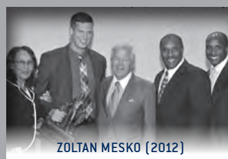
ZOLTAN MESKO (2012)