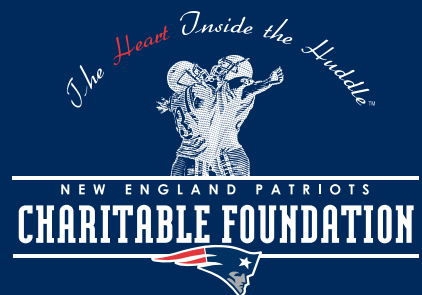
Robert K. Kraft

A handwritten signature in white ink that reads "Robert Kraft". The signature is fluid and stylized, with the first and last names being more prominent.