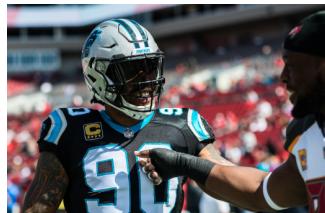
Three of the top four sack artists in NFL history played for the Panthers at one point in their career.