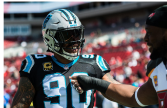
Three of the top four sack artists in NFL history played for the Panthers at one point in their career.

Julius Peppers had three pass deflections against Tampa Bay in Week 9, tying Carlos Dunlap for the most by a defensive end in a single game this year.