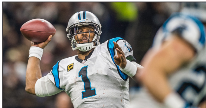
Cam Newton threw for 349 yards against New Orleans in the playoffs last season.