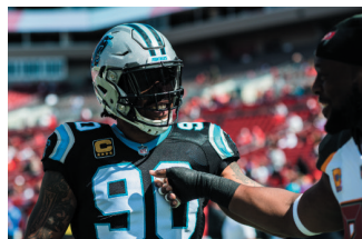
Three of the top four sack artists in NFL history played for the Panthers at one point in their career.

Julius Peppers is Carolina's all-time leader in forced fumbles (31), and had two in 2017. In his career, he has 49 forced fumbles, good for second in the NFL since 2000. Peppers needs four forced fumbles to pass Robert Mathis (52) for most forced fumbles since 2000.