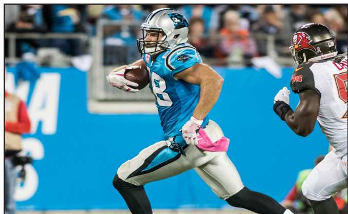
Greg Olsen tallied 181 receiving yards on nine catches against Tampa Bay on 10/10/16.

Rushing yards: 186, DeAngelo Williams vs. Tampa Bay (12/8/08) Receiving yards: 181, Greg Olsen vs. Tampa Bay (10/10/16) Receptions: 10, Greg Olsen vs. Tampa Bay (12/14/14) Passing yards: 303, Cam Newton at Tampa Bay (9/9/12)