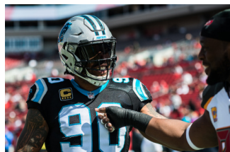
Three of the top four sack artists in NFL history played for the Panthers at one point in their career.

Julius Peppers is Carolina's all-time leader in forced fumbles (33), and has two in the last two games in 2018. In his career, he has 51 forced fumbles, good for second in the NFL since 2000. Peppers needs two forced fumbles to pass Robert Mathis (52) for most forced fumbles since 2000.