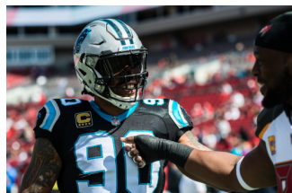
Three of the top four sack artists in NFL history played for the Panthers at one point in their career.

Julius Peppers is Carolina's all-time leader in forced fumbles (32), and had two in 2017. In his career, he has 50 forced fumbles, good for second in the NFL since 2000. Peppers needs three forced fumbles to pass Robert Mathis (52) for most forced fumbles since 2000.