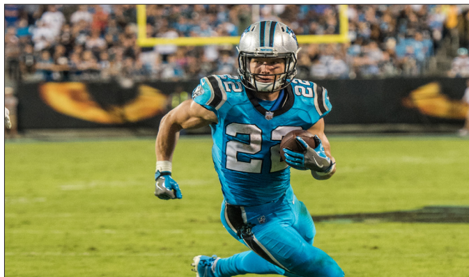
Christian McCaffrey had 10 receptions vs. Philadelphia last year, setting a then-franchise record for receptions in a game by a running back.

Rushing yards: 125, Jonathan Stewart vs. Philadelphia (10/25/15) Receiving yards: 119, Greg Olsen at Philadelphia (11/10/14) Receptions: 10, Christian McCaffrey vs. Philadelphia (10/12/17) Passing yards: 306, 2x, Cam Newton at Philadelphia (11/10/14)