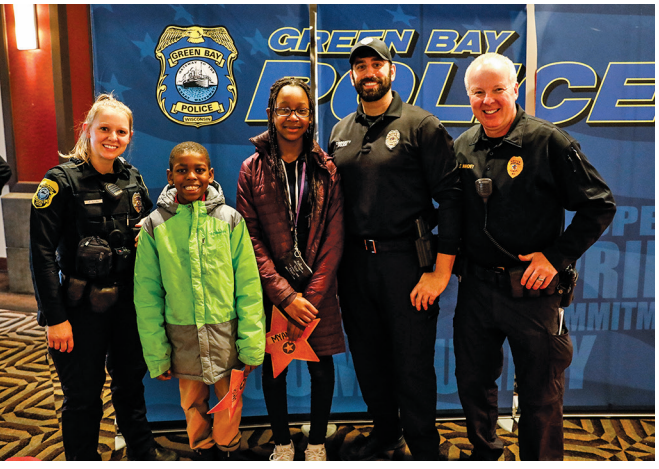
PACKERS & PALS MOVIE NIGHT

Relationships between kids in the Brown County PALS program and Green Bay Police were built during the inaugural Police, Packers and PALS Movie Night. Youth under the age of 12 observed K-9 demonstrations and participated in character presentations prior to enjoying dinner and a movie.