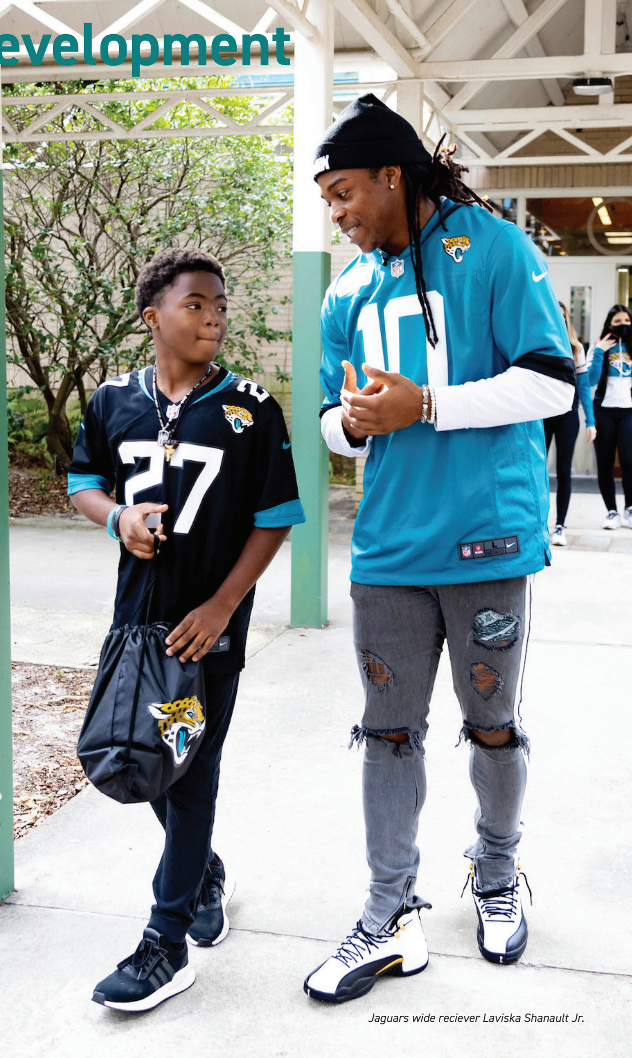
Jaguars wide receiver Laviska Shanault Jr.