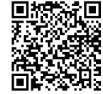
ALL-PREP Top 25 athletes

The top 25 high school football players in Jacksonville were selected by Action Sports Jax based on their on-and-off the field achievements and considered the best at their positions. The Jaguars honored these student athletes at the Jaguars versus Texans game last season, surprising them with custom Jaguars jerseys, giving them the honor of holding the flag during the national anthem and recognizing their accomplishments in-game.