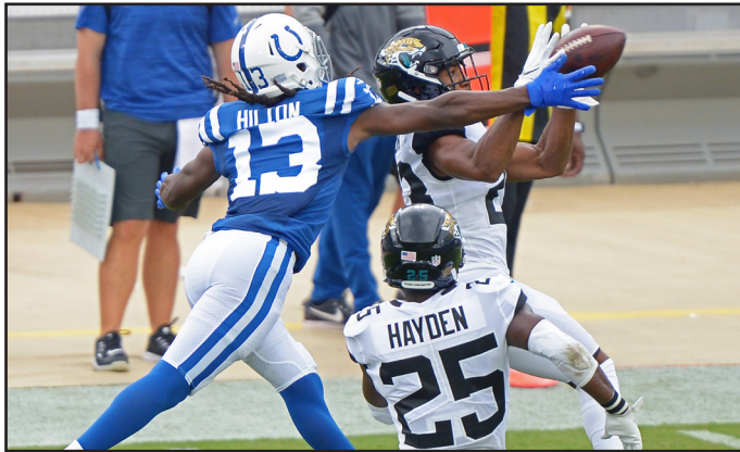
Former Gator CB CJ Henderson was the Jaguars' 2020 first-round selection and recorded 27 tackles and six passes defensed in his rookie season.