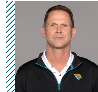
TRENT BAALKE GENERAL MANAGER

Trent Baalke was hired as the Jaguars general manager on Jan. 21, 2021.