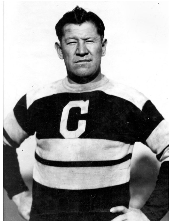
The Legendary Jim Thorpe

While the Bulldogs are no longer around, pro football remembers its early days in Canton, Ohio. Visitors, young and old, enjoy the story of pro football's history in the city where the NFL began!