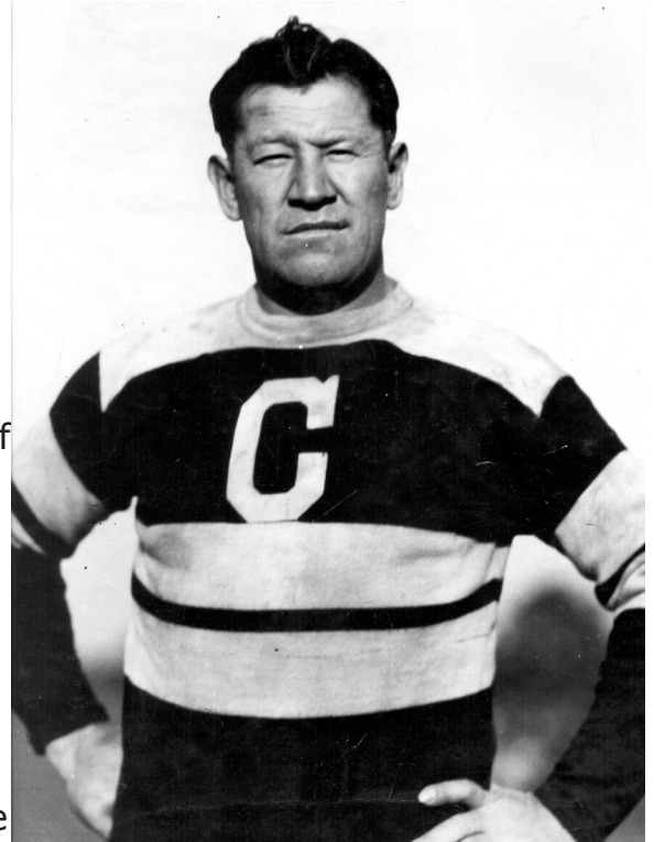
The Legendary Jim Thorpe

While the Bulldogs are no longer around, pro football remembers its early days in Canton, Ohio. Visitors, young and old, enjoy the story of pro football's history in the city where the NFL began!