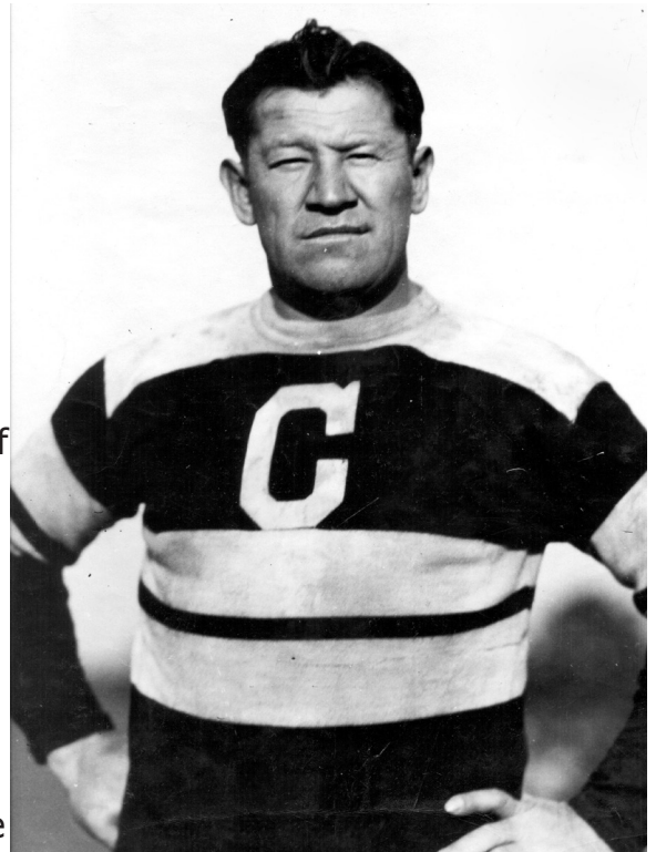
The Legendary Jim Thorpe

While the Bulldogs are no longer around, pro football remembers its early days in Canton, Ohio. Visitors, young and old, enjoy the story of pro football's history in the city where the NFL began!