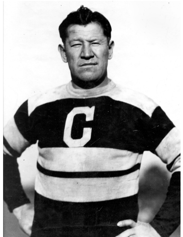
The Legendary Jim Thorpe

While the Bulldogs are no longer around, pro football remembers its early days in Canton, Ohio. Visitors, young and old, enjoy the story of pro football's history in the city where the NFL began!