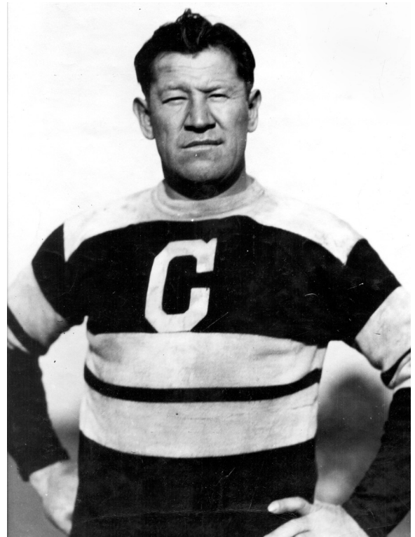
The Legendary Jim Thorpe

While the Bulldogs are no longer around, pro football remembers its early days in Canton, Ohio. Visitors, young and old, enjoy the story of pro football's history in the city where the NFL began!