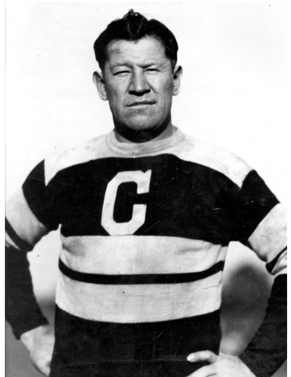
The Legendary Jim Thorpe

While the Bulldogs are no longer around, pro football remembers its early days in Canton, Ohio. Visitors, young and old, enjoy the story of pro football's history in the city where the NFL began!