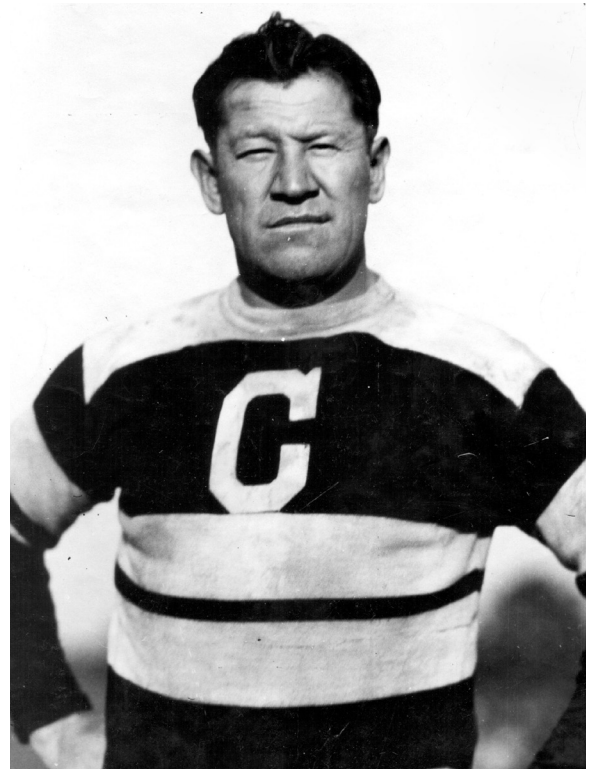
The Legendary Jim Thorpe

While the Bulldogs are no longer around, pro football remembers its early days in Canton, Ohio. Visitors, young and old, enjoy the story of pro football's history in the city where the NFL began!