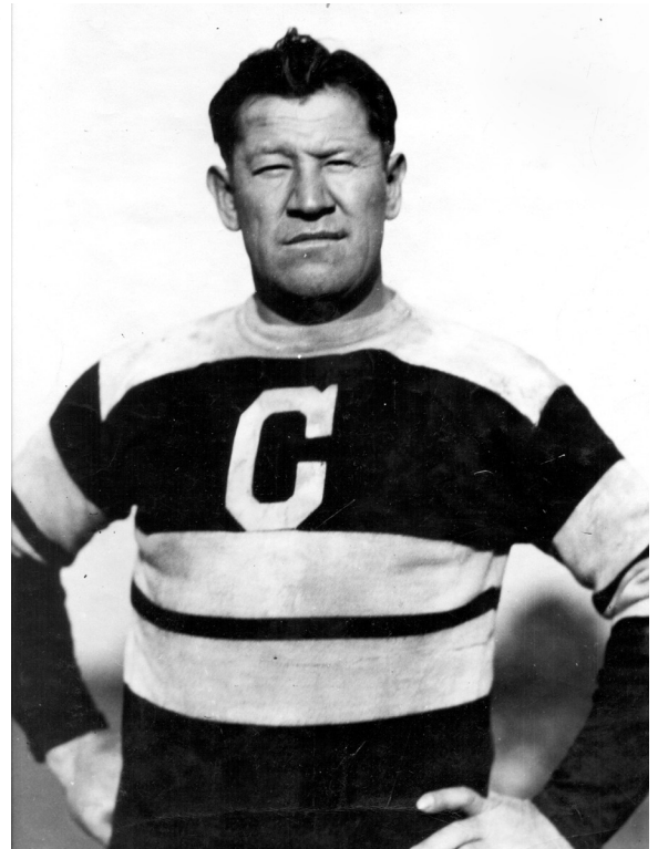
The Legendary Jim Thorpe

While the Bulldogs are no longer around, pro football remembers its early days in Canton, Ohio. Visitors, young and old, enjoy the story of pro football's history in the city where the NFL began!