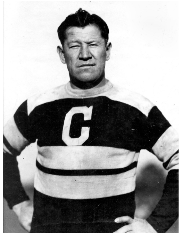
The Legendary Jim Thorpe

While the Bulldogs are no longer around, pro football remembers its early days in Canton, Ohio. Visitors, young and old, enjoy the story of pro football's history in the city where the NFL began!