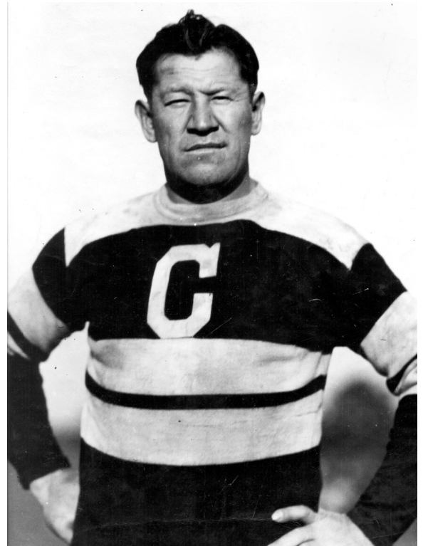
The Legendary Jim Thorpe

While the Bulldogs are no longer around, pro football remembers its early days in Canton, Ohio. Visitors, young and old, enjoy the story of pro football's history in the city where the NFL began!