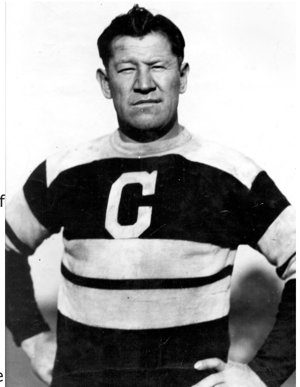
The Legendary Jim Thorpe

While the Bulldogs are no longer around, pro football remembers its early days in Canton, Ohio. Visitors, young and old, enjoy the story of pro football's history in the city where the NFL began!