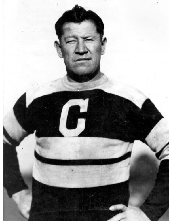
The Legendary Jim Thorpe

While the Bulldogs are no longer around, pro football remembers its early days in Canton, Ohio. Visitors, young and old, enjoy the story of pro football's history in the city where the NFL began!