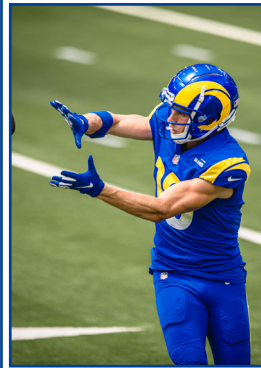
WR Cooper Kupp

Since McVay took over before the 2017 season, the Rams offense has been amongst the most productive in the league. L.A. averages 395.4 scrimmage yards per regular season game under the guidance of McVay. The Rams are one of only three teams to average over 395 scrimmage yards over the last 64 regular season games.