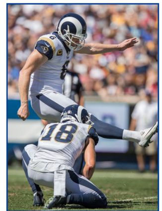
P Johnny Hekker

Hekker joins Cardinals K Phil Dawson as the only active players with at least one made field goal and a touchdown pass.