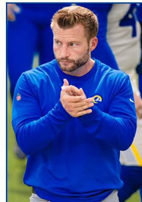
HC Sean McVay

Rams Head Coach Sean McVay took over a team that was coming off of a 4-12 season and ranked 32nd in scoring. McVay helped transform it into the No. 1 scoring team in the league and helped secure the franchise's first NFC West title since 2003.