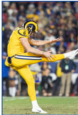
P Johnny Hekker

The Oregon State product established a career-long 75-yard punt in the team's 2016 Week 9 contest against the Carolina Panthers, a record that stuck for a week before he booted a 78-yarder against the New York Jets in the Rams' Week 10 contest. On the season, Hekker had three punts over 75 yards.