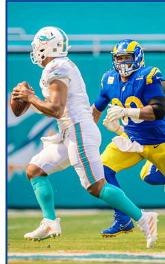
DL Aaron Donald

In L.A.'s Week 8 game at Miami, DL Aaron Donald recorded a strip-sack on rookie QB Tua Tagovailoa. It marked the 17th time the Rams defense has abruptly ended on opponents' opening drive since 2017.