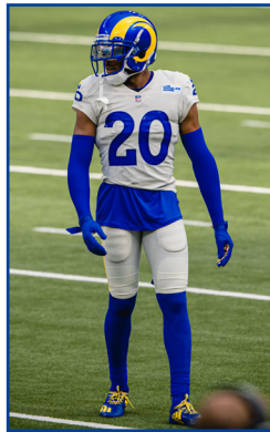
CB Jalen Ramsey

The Rams have taken the ball from their opponents 104 times, the second-most in the league since the start of the 2017 season and scored 393 points off takeaways since McVay became the head coach, the second-most in the league since the start of the 2017 season. Last season, L.A. took the ball away from their opponents 30 times, the third-most in the NFL. L.A. scored a league-best 113 points off takeaways during the 2018 regular season.