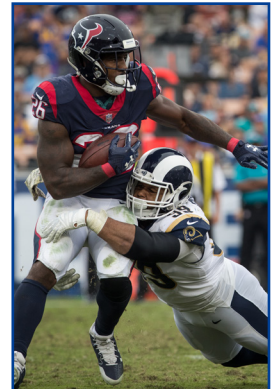
DL Aaron Donald

Rams DL Aaron Donald has used an explosive first step to make a living in opponents' backfields since entering the league in 2014. Since the start of the 2014 season, Donald leads the league in tackles for loss, tallying 131 in 110 games played, including 14 TFL during the 2020 regular season.