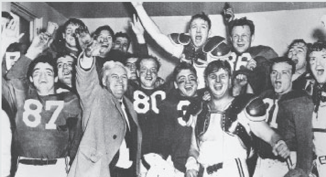
The 1947 Cardinals won the NFL Championship with a 10-3 overall record. They defeated the Philadelphia Eagles 28-21 at Chicago's Comiskey Park in the NFL's 15th title contest.

The game was defined by Chicago's quick-openers, producing three long scoring runs from scrimmage—two 70-yarders by Angsman and a 44-yarder by Trippi. In the third quarter, Trippi returned a punt 75 yards for a touchdown. Angsman's thrilling fourth-quarter duplication of his second-period 70-yard touchdown strike enabled him to break the NFL championship Game record for rushing yards with 159. But Philadelphia fought evenly throughout with quarterback Tommy Thompson setting two playoff records on 27-of-44 passing for 297 yards. The Cardinals' 28-21 victory, however, wasn't secured until Goldberg's late-game interception.