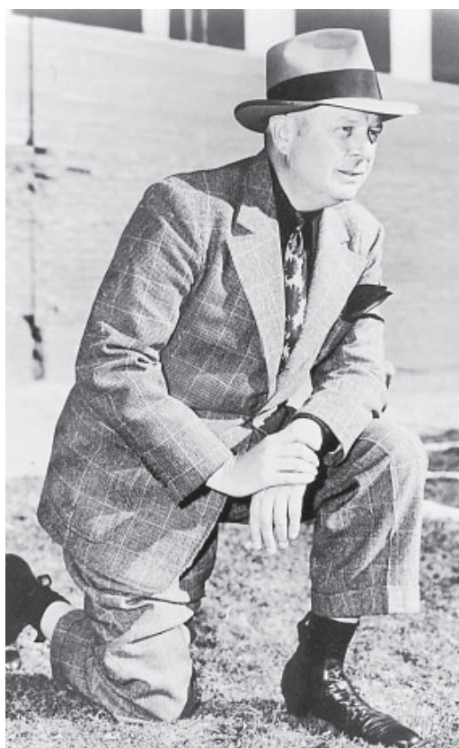
Cardinals owner Charles W. Bidwill, Sr. is a member of the Pro Football Hall of Fame.

The team sorely missed Nevers' magic on the field and the Cardinals endured difficult years in