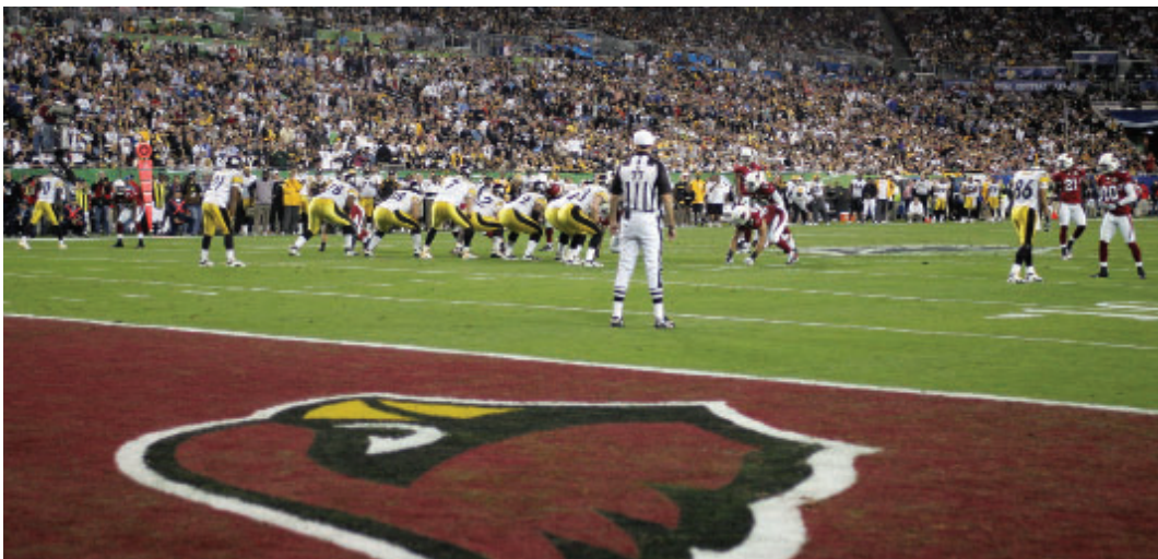
The Cardinals made their first-ever Super Bowl appearance when they met the Pittsburgh Steelers in Super Bowl XLIII.