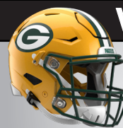
GREEN BAY PACKERS

17 Passing TDs allowed by the Cardinals defense since Week 7 of last season, the fewest in the NFL. The team has allowed just 34 total TDs, tied for the second-fewest across the league.