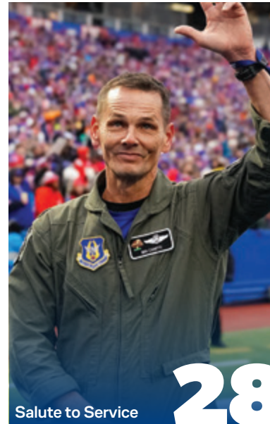
Salute to Service