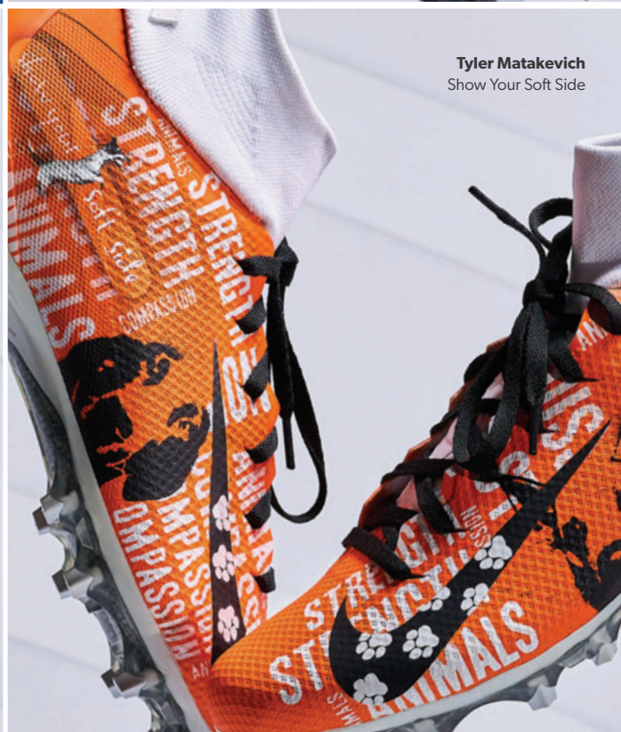
Tyler Matakovich Show Your Soft Side