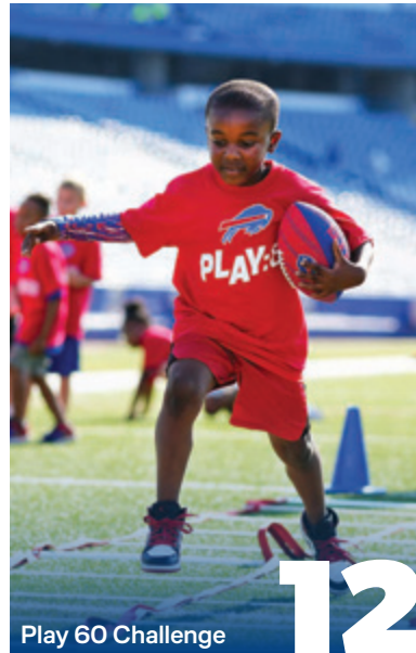
Play 60 Challenge