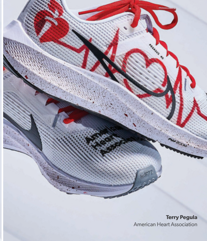
Terry Pegula American Heart Association