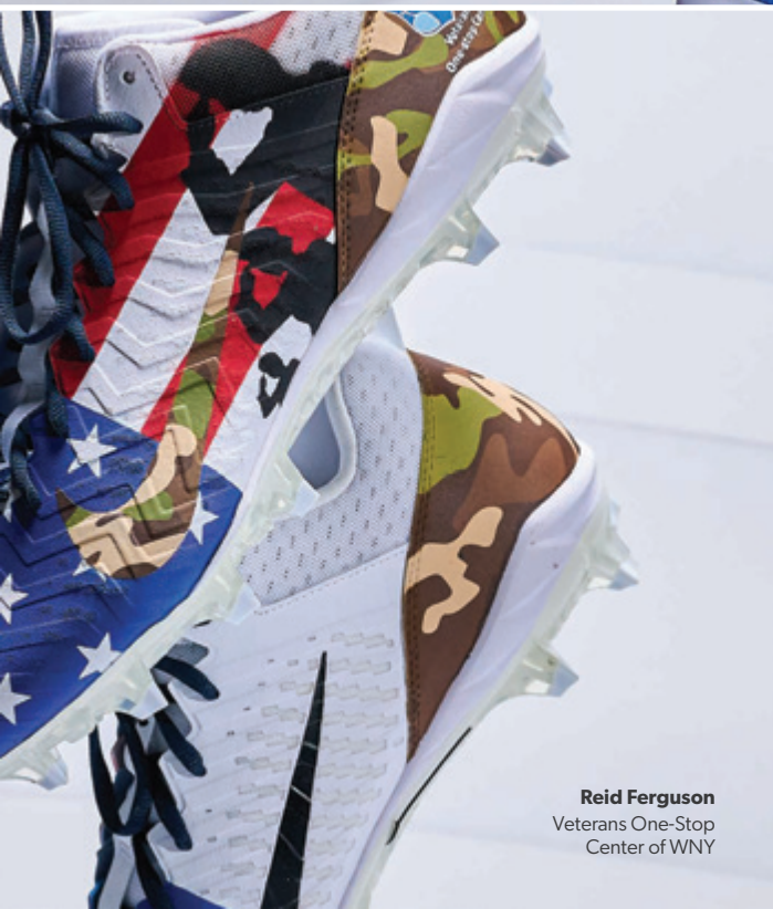
Reid Ferguson Veterans One-Stop Center of WNY