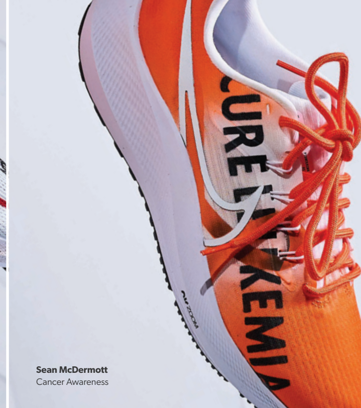
Sean McDermott Cancer Awareness