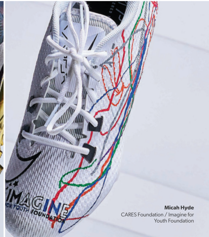
Micah Hyde CARES Foundation / Imagine for Youth Foundation