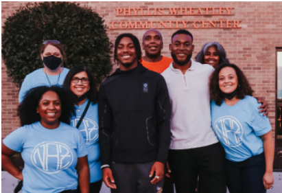
Vikings WR Justin Jefferson distributed 100 free backpacks filled with school supplies outside the Phyllis Wheatley Community Center ahead of the new school year for students.