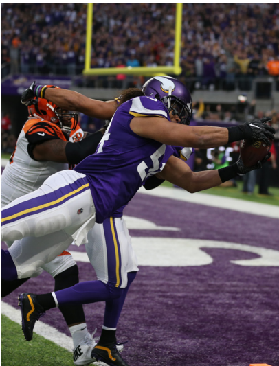
LB Eric Kendricks returning his second career interception to the house by picking off Bengals QB Andy Dalton.