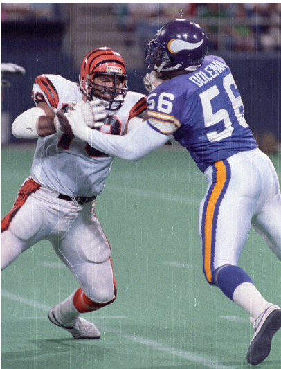
DE Chris Doleman during his 4.0 sack performance in the Metrodome during the 1989 season.