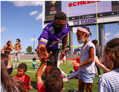
Danielle Hunter recently participated in a People Serving People event, supplying children, through Scheels, with new clothes and school supplies as they prepare to start the school year.