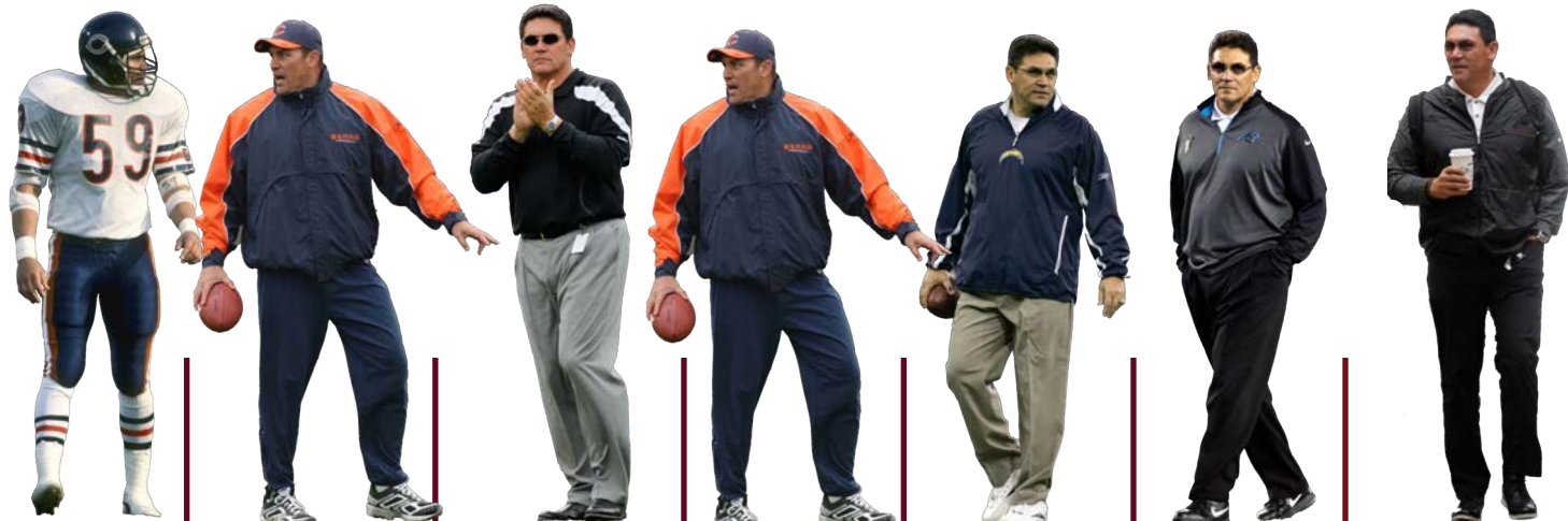
Chicago Bears Linebacker 1984-92