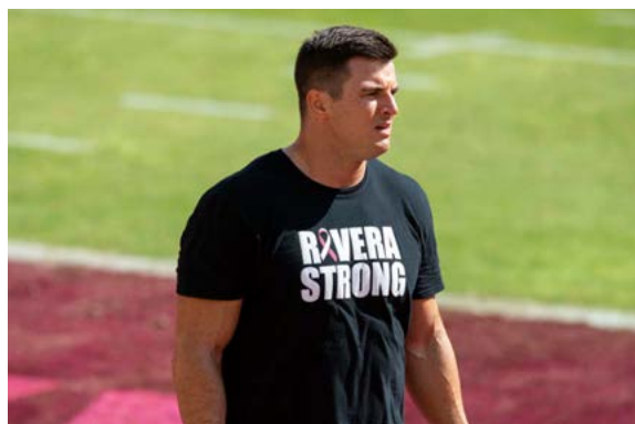
Defensive End Ryan Kerrigan wearing a Rivera Strong t-shirt during pregame warmups.