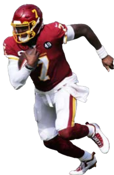
Dwayne Haskins Jr. [23]

Washington handed the keys over to Quarterback Dwayne Haskins Jr. in Week 9 last season. The first-round pick has grown more and more comfortable as he progressed through last season. This offseason, Haskins Jr. looked to build on his end-of-year success and lost close to 20 pounds.