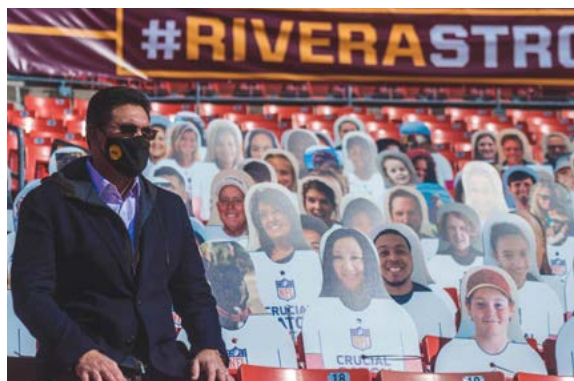
Head Coach Ron Rivera sitting among the many cardboard cutouts of his former players, coaches, family and friends.