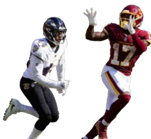
Terry McLaurin [24]

Wide Receiver Terry McLaurin emerged as the team's top target in his rookie season last year. The Ohio State product's big-play ability has placed him on every team's radar. McLaurin finished the 2019 season with 65.6 yards per game, the second-best amongst NFL rookies. His 919 receiving yards were also the second-most amongst NFL rookies.