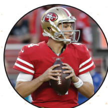
NICK MULLENS (2018)