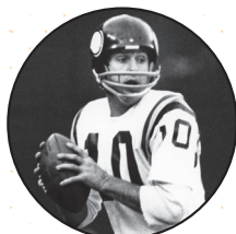
FRAN TARKENTON (1961)