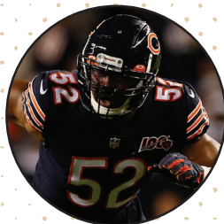
KHALIL MACK [6]